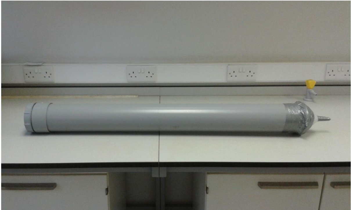
An example sediment tube trap