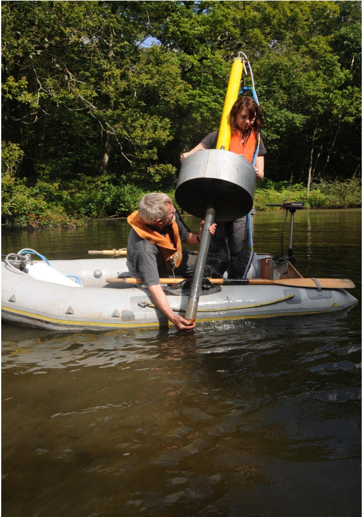
Coring sedimentary archives